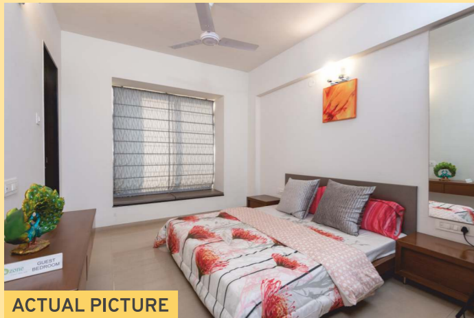
SOPHISTICATED, COZY AND LUXURIOUS PLACE TO REST