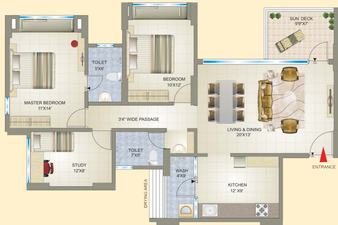
2.5 BHK Plan View