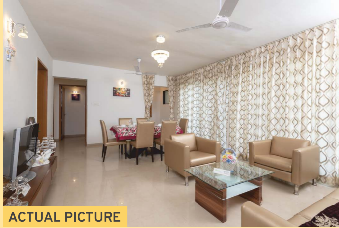
NATURALLY LIT, SPACIOUS AND INVITING LIVING AREA