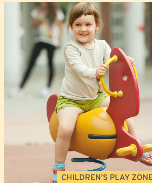
CHILDREN'S PLAY ZONE

Let your kids have fun in their own sphere of play area while you pump up in the gym or burn your calories on the jogging track.